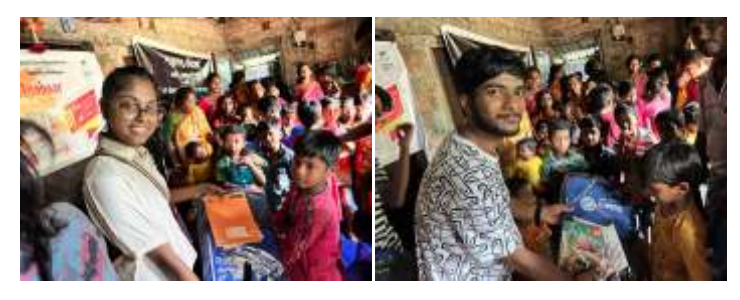
villege at 3:20pm with heavy rain.

Members from NatunerKhoje had started distribution of new clothes among children and teachers when we reached at school premises. It is a private residence of a local villager. He is kind enough to provide his premises to the under privilege of the society for education.